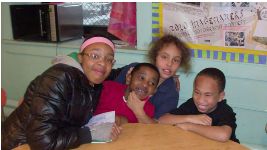
Families celebrating Martin Luther King Day.