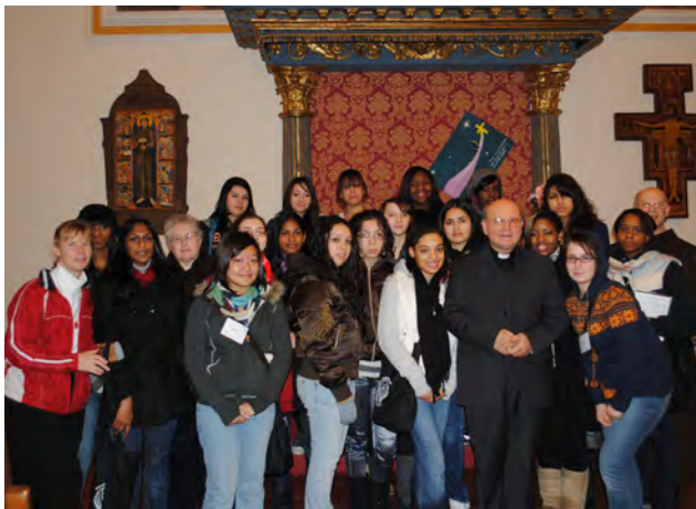
Students meet with the Bishop of Assisi

For these students, the journey did not begin when they boarded the bus for the airport on December 27 th . It began with the dream to experience something bigger than them and see a part of the larger world. In preparation for these ten days in Italy, students met regularly