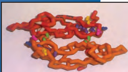
Vascular Endothelial Growth Factor Type-B or VEGF-B.