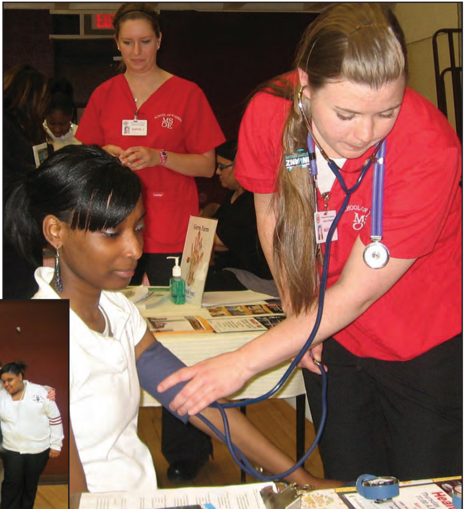
above: Students learn the importance of testing blood pressure and more at the Second Annual SJA Health Fair.

By offering students health education and medical screenings, we hope to increase students' health awareness, promote a healthy lifestyle, and promote better-informed consumers in the health care system.