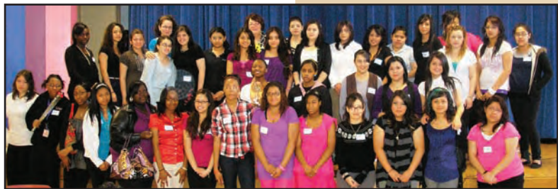
Spring Achiever Breakfast 2010

On April 28, St. Joan Antida High School held its 2nd annual Achiever Breakfast for students and their parents. Recognizing the importance of celebrating student achievement, these young women were nominated by teachers for their positive attitude toward learning, for their generosity and kindness toward others, and for their commitment to responsible actions.