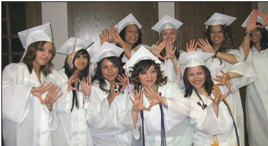
Some of the graduating class of 2010 pose for the camera.