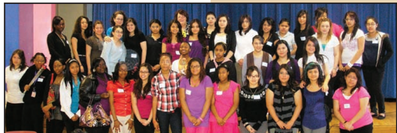
Spring Achiever Breakfast 2010

On April 28, St. Joan Antida High School held its 2nd annual Achiever Breakfast for students and their parents. Recognizing the importance of celebrating student achievement, these young women were nominated by teachers for their positive attitude toward learning, for their generosity and kindness toward others, and for their commitment to responsible actions.