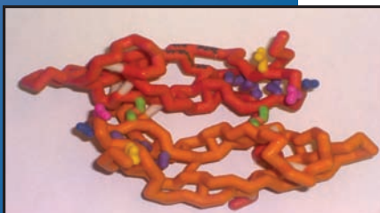
Vascular Endothelial Growth Factor Type-B or VEGF-B.