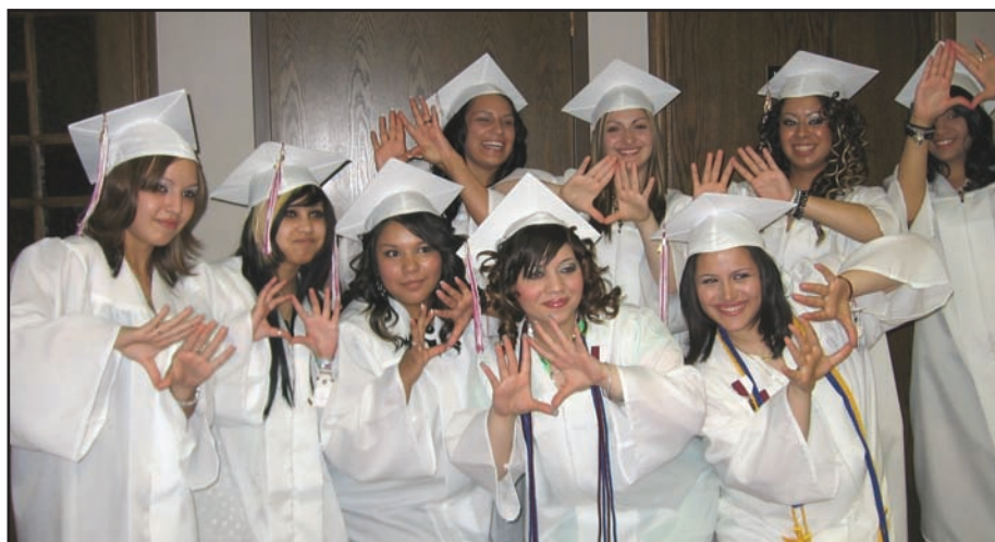
Some of the graduating class of 2010 pose for the camera.